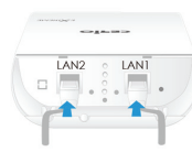
LAN1 port for PoE Adapter and LAN2 port for LAN Link