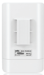
Housing Design For Pole Mounting