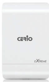
Built in 15 dBi Panel Antenna (Beam Width H Plane 65°/ E Plane E35°)