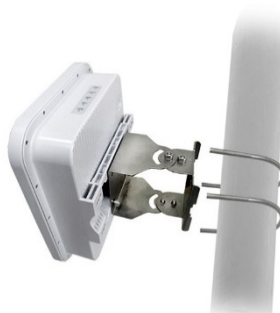
Adjustable Wall Mounting (OW-PKUR)