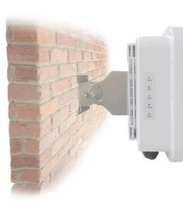
Adjustable Wall Mounting (OW-PKUR)