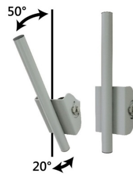
Wall Mount Vertical Adjustment (OW-PKT Only)