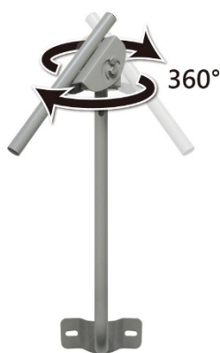
Horizontal Adjustment (OW-PKTB & OW-PKTB-T)