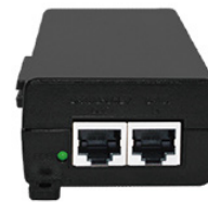
30W Internal Power