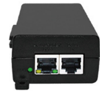
30W External Power