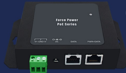
90 WALT MULTI GIGABIT (FPOE-DXG-90W)