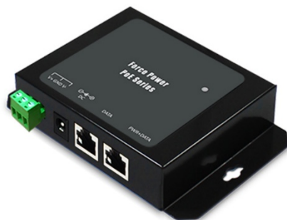
60 WALT MULTI GIGABIT (FPOE-DXG-60W)