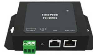
60Watt 1/2.5/5/10Gigabit PoE Injector (FPOE-DXG-60W)

Taiwan Manufacturing: CERIO Force Power Wide Temperature PoE++ Injector Series, provides an industrial durable and high-reliability metal case design. Supports desktop and wall mounting installation. Plug-and-Play, requires no configuration, which can meet high-standard industrial environment network construction requirements.