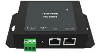
90Watt 1/2.5/5/10Gigabit PoE Injector (FPOE-DXG-90W)

Wide Temperature Design: Supports a wide range temperature design of -40° ~ 75° C. It's durable, reliable and supports wall mounting installation, which fully meets the application requirements in various environments. The wide temperature design allows the equipment to operate stably in extremely low and extremely high temperatures, making it the best helper for enterprises.